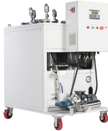
WVD-II Varnish Removal Unit