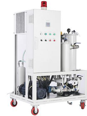
WZJC Vacuum Dehydration Oil purifier