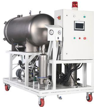
WJJ Water coalescence separation oil purifier