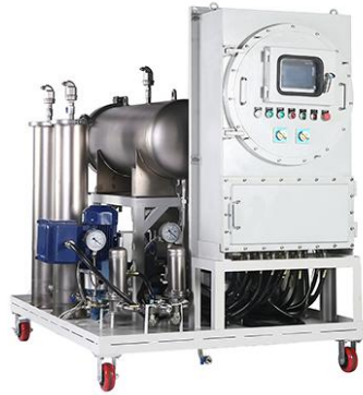
WVDJ Varnish Removal Unit Plus edition