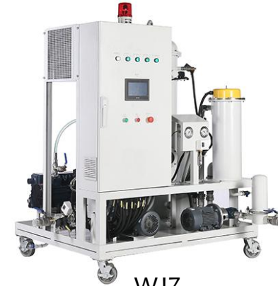
WJZ Balanced charge vacuum oil purifier