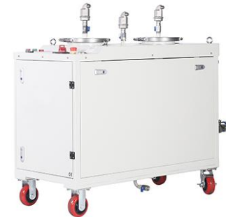
WJL Balanced charge coalescence oil purifier