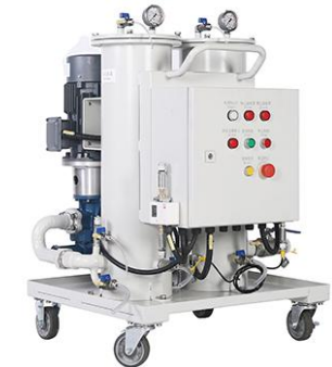
WJYJ Standard oil purifier