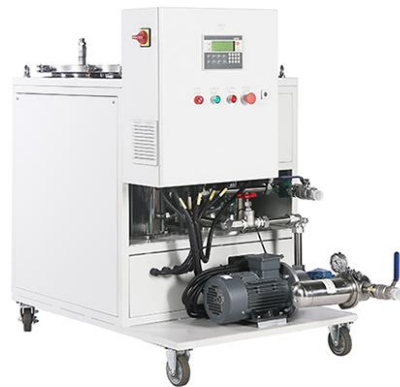
WJD Electrostatic oil purifier